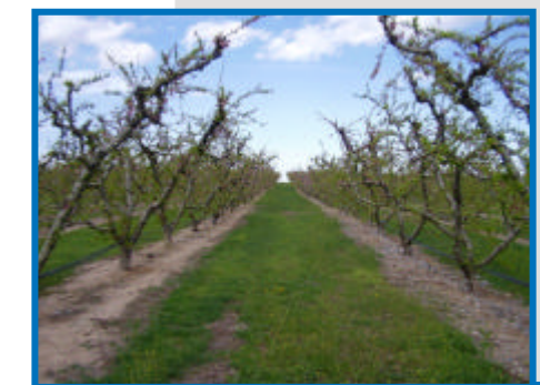
Peach trees, Zaragoza, Spain

The parameters to be measured by the trial were chlorosis by SPAD measurements, yield quantity (Kg/tree, n° fruits) and quality (fruit size). This interim report compares the performance at the first assessment which is chlorosis measured by SPAD meter.